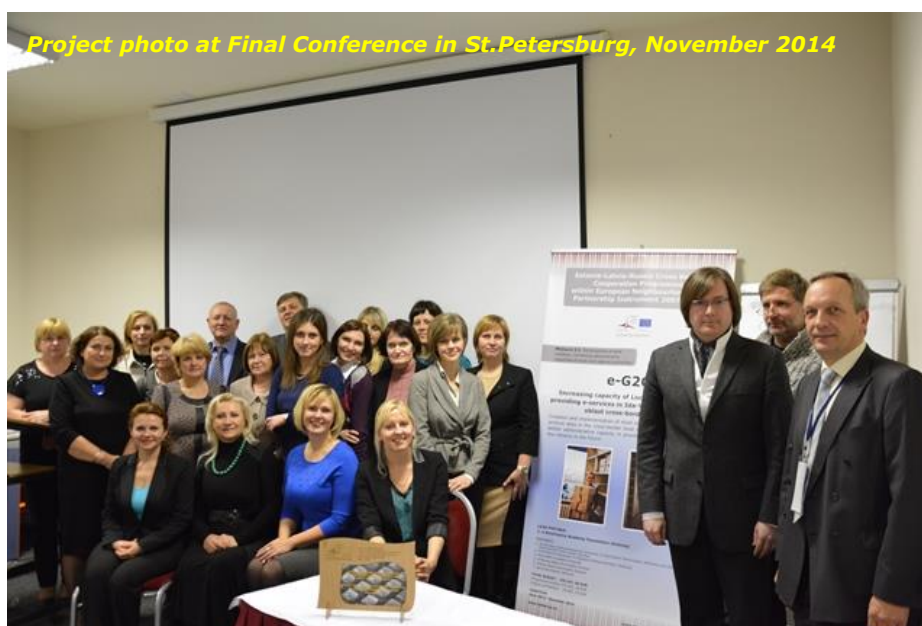
Project photo at Final Conference in St.Petersburg, November 2014

More than 300 000 people from the programme area and beyond informed on the project results and solutions