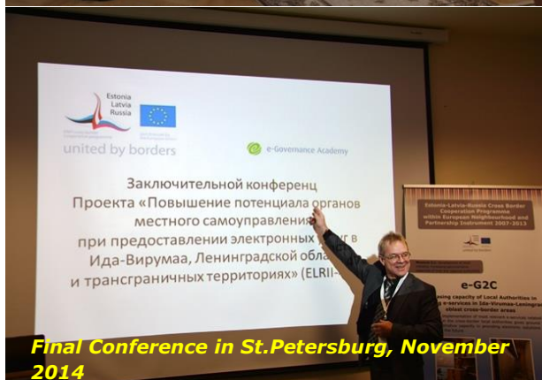
Final Conference in St.Petersburg, November 2014