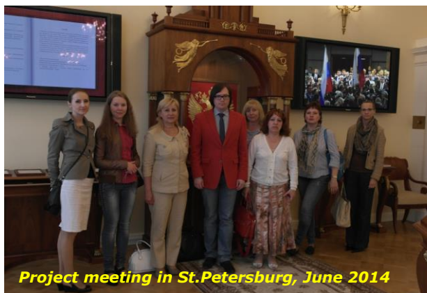
Project meeting in St.Petersburg, June 2014