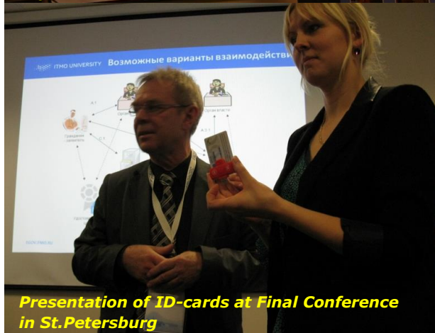
Presentation of ID-cards at Final Conference in St.Petersburg