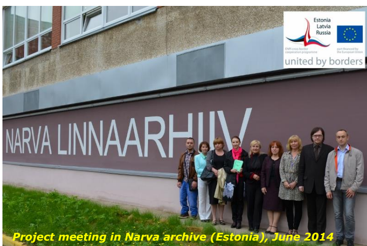
Project meeting in Narva archive (Estonia), June 2014