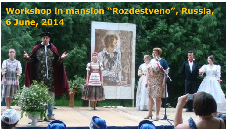
Workshop in mansion "Rozdestveno", Russia, 6 June, 2014