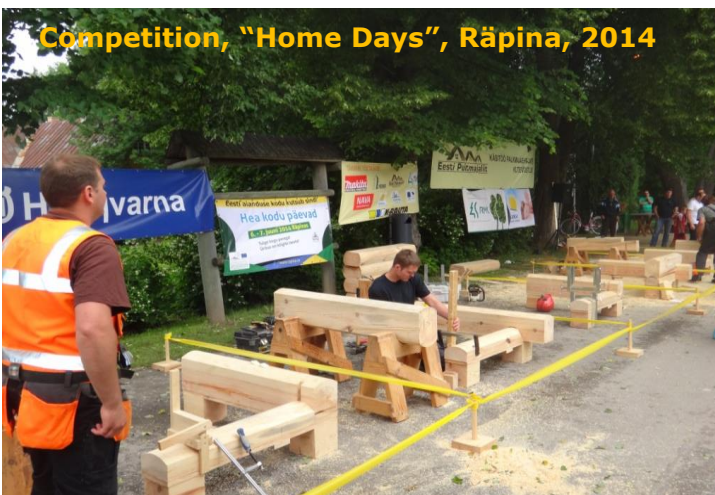
Competition, "Home Days", Rāpina, 2014