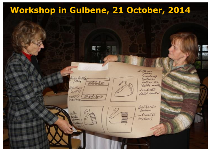
Workshop in Gulbene, 21 October, 2014