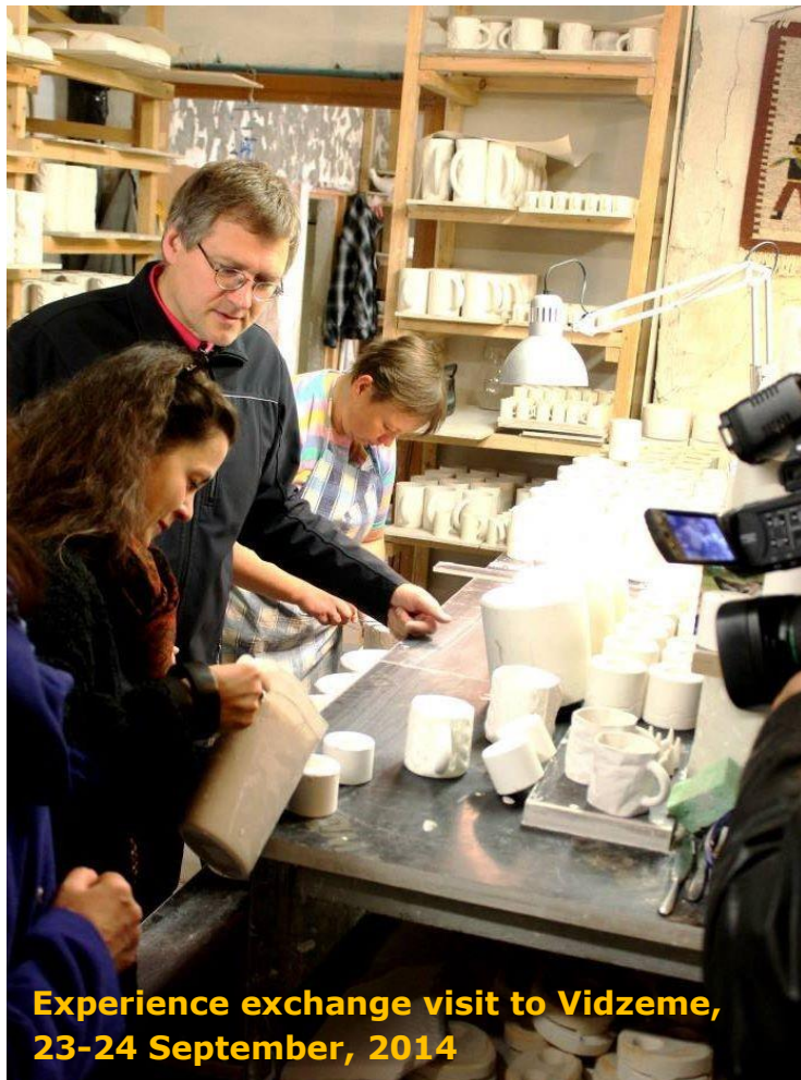
Experience exchange visit to Vidzeme, 23-24 September, 2014