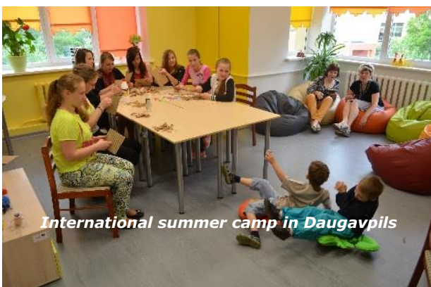
International summer camp in Daugavpils