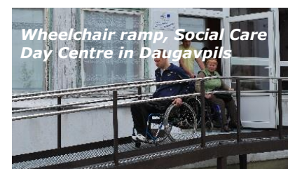
Wheelchair ramp, Social Care Day Centre in Daugavpils