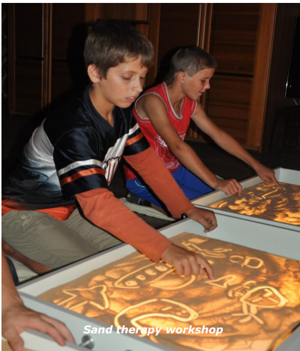
Sand therapy workshop