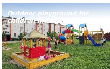
Outdoor playground for children in Latvia