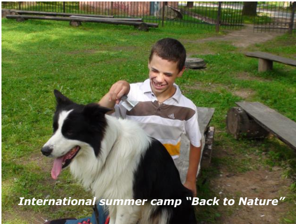
International summer camp "Back to Nature"