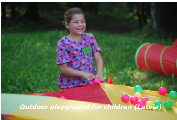
Outdoor playground for children (Latvia)