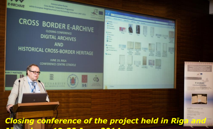
urmala on 19-20 June 2014