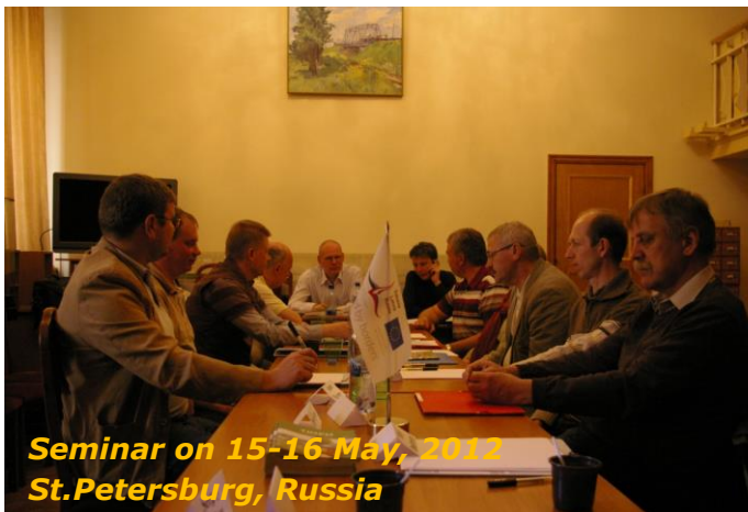
Seminar on 15-16 May, 2012 St. Petersburg, Russia