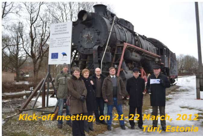
Kick-off meeting, on 21-22 March, 2012 Türi, Estonia