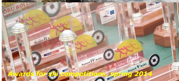
Awards for ski competitions, spring 2014