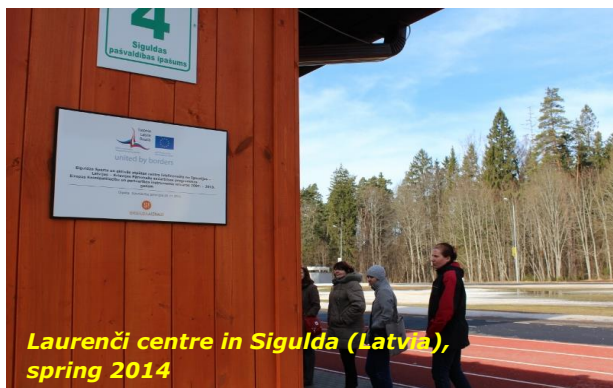
Laurenči centre in Sigulda (Latvia), spring 2014