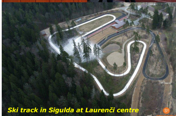
Ski track in Sigulda at Laurenči centre