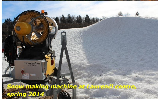
Snow making machine at Laurenči centre, spring 2014