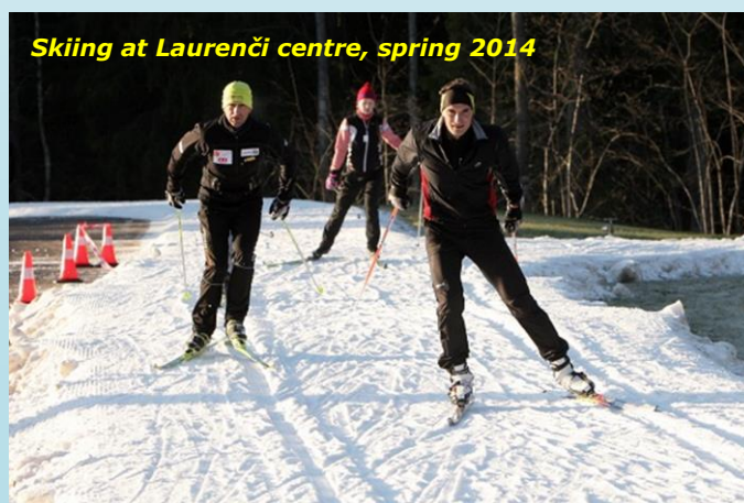
Skiing at Laurenči centre, spring 2014

Promotional materials in 4 languages for sport infrastructure and joint activities widely available for local and regional audience