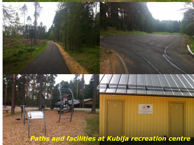
Paths and facilities at Kubija recreation centre