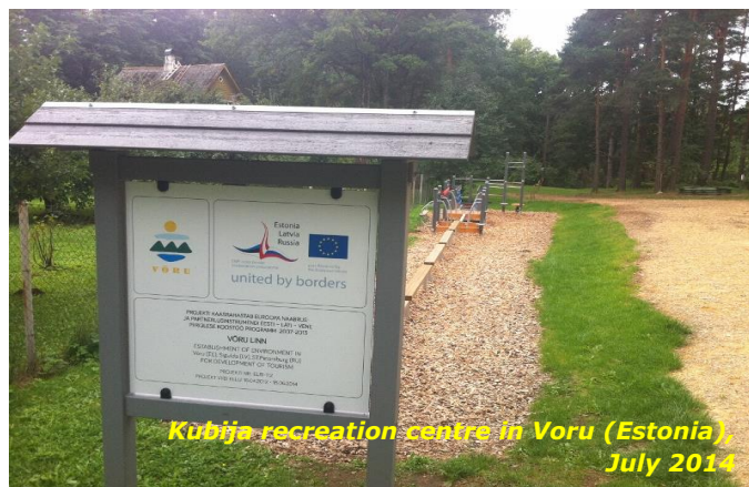
Kubija recreation centre in Voru (Estonia), July 2014

Project webpages created and information published on www.sigulda.lv , www.voru.ee , www.kfis.spb.ru