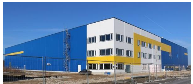
Construction of OÜ Westaqua-Invest (Aquaphore) production premises in Kadastiku Industrial Park (Narva, Estonia) in summer 2014