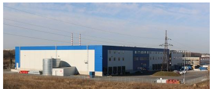
Construction of OÜ Narva Logistics Logistical Hub in Kadastiku Industrial Park (Narva, Estonia) in summer 2014