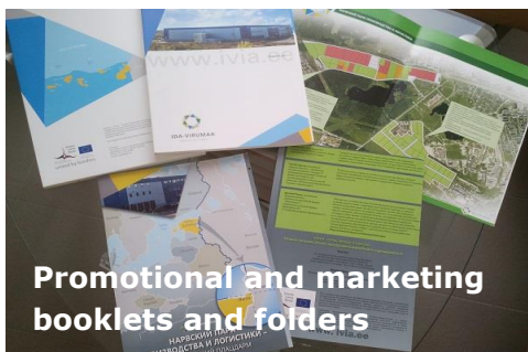
Promotional and marketing booklets and folders