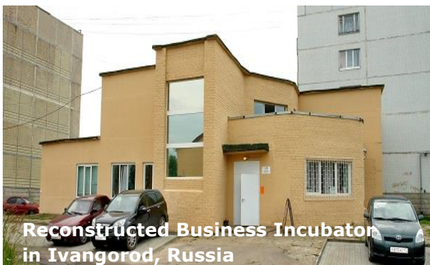
Reconstructed Business Incubator in Ivangorod, Russia