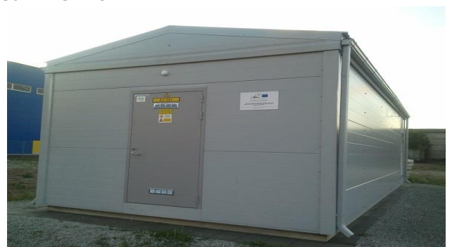
Electrical substation with electrical power 8MW. Kadastiku Industrial Park (Narva, Estonia) in February 2015