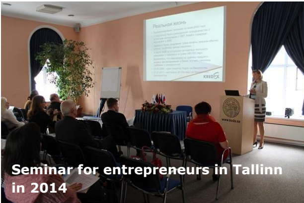
Seminar for entrepreneurs in Tallinn in 2014