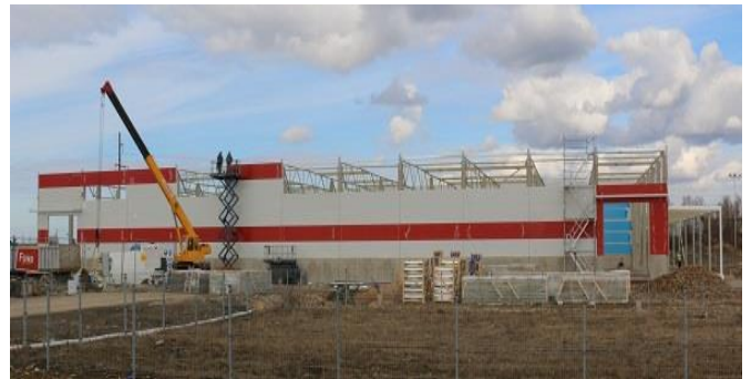
Construction of OÜ Emlak Eesti production premises in Kadastiku Industrial Park (Narva, Estonia), in summer 2014

Promotional and marketing materials produced and disseminated (500 brochures, 1 000 folders etc)