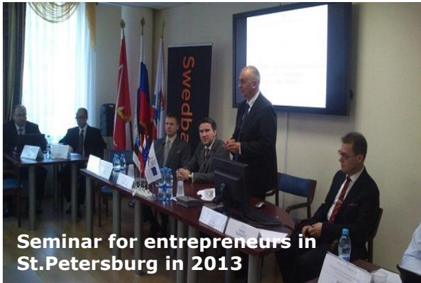
Seminar for entrepreneurs in St.Petersburg in 2013